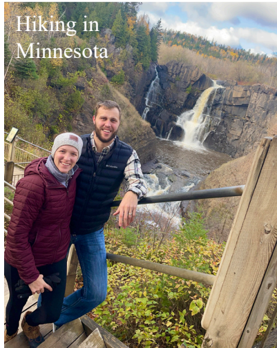
Hiking in Minnesota