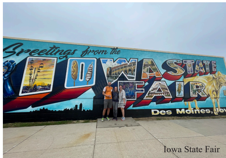
Iowa State Fair