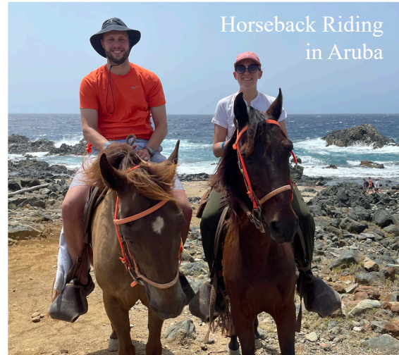
Horseback Riding in Aruba