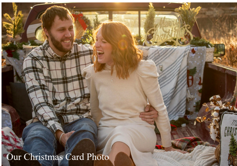
Our Christmas Card Photo