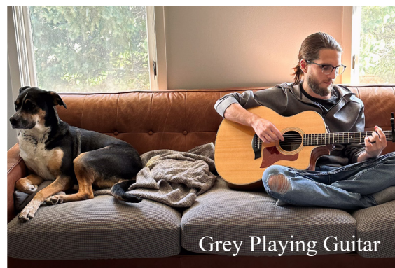
Grey Playing Guitar