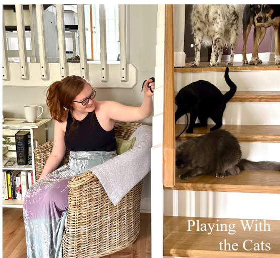
Playing With the Cats