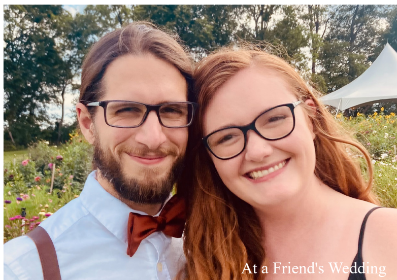
At a Friend's Wedding