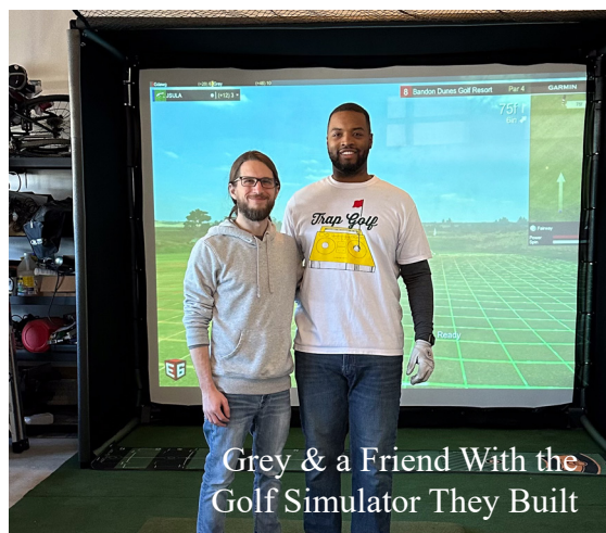
Grey & a Friend With the Golf Simulator They Built