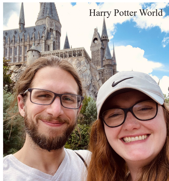
Harry Potter World