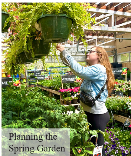
Planning the Spring Garden