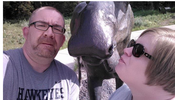
A Selfie With the Moose Statue in the Tetons