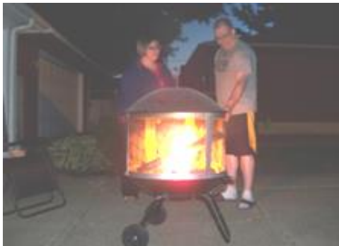
Camp Fire at Home