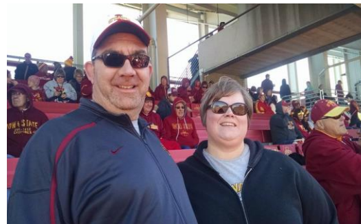
Iowa State Football Game