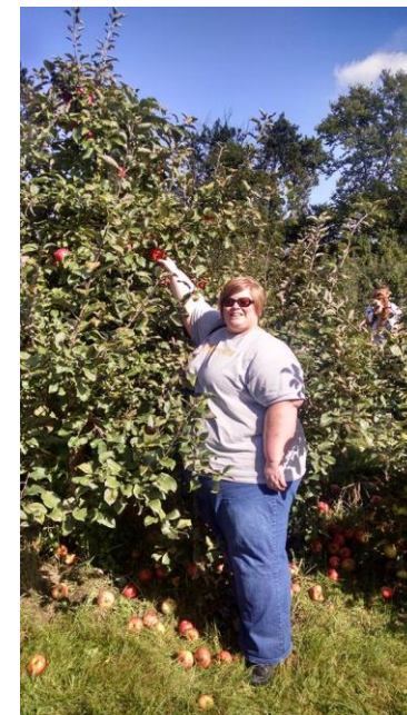
Picking Apples at the Orchard in Wisconsin