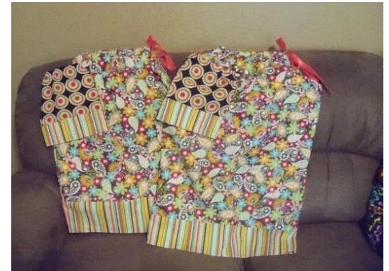
Matching Dresses For Nieces And Their Dolls