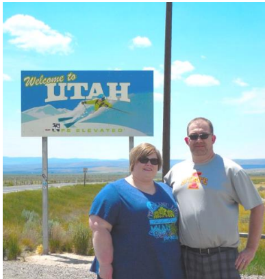
The Utah Border Traveling to OR